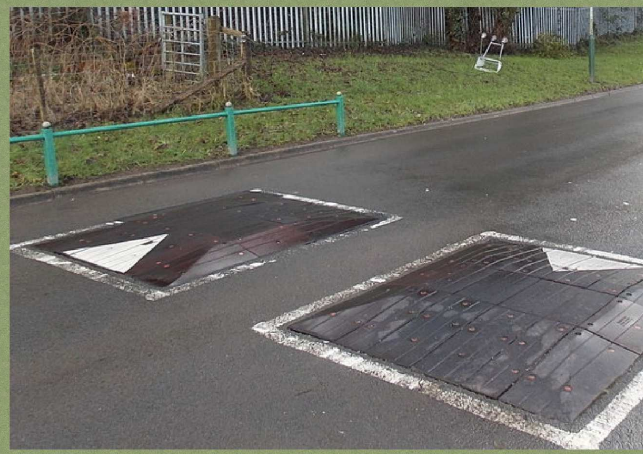
Speed bumps to calm traffic along Butterfield Way