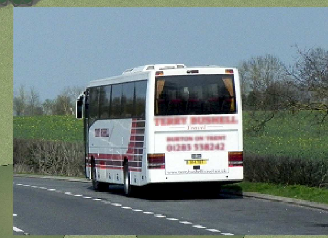
Coach / bus layby parking