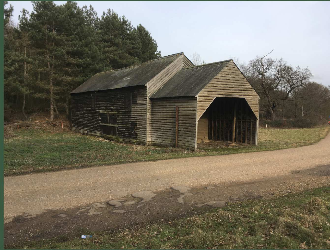
Existing barn to be retained