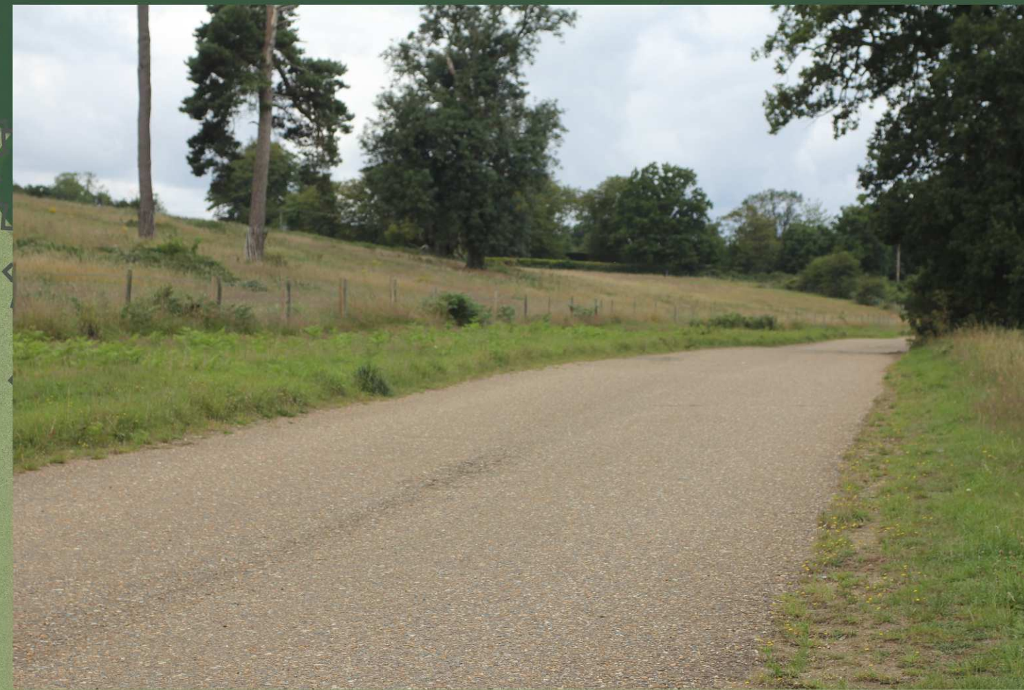
Proposed timber bollards to flank both sides of existing roadway